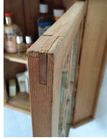
Bridle joint on an old medicine cabinet